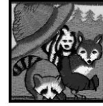
JN WEBSTER SR

June Norcross Webster Scout Reservation is located in scenic Ashford, Connecticut. Established in 1964, the reservation occupies 1,200 acres of land that is home to approximately 1,230 Boy Scouts and Cub Scouts each summer during its six-week season.